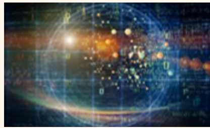
Data Science and AI (DSAI)