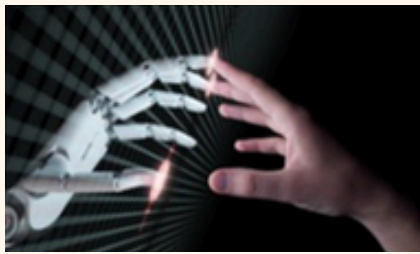
Control and Robotic Systems (CRS)