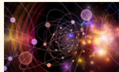
Quantum Engineering (QE)